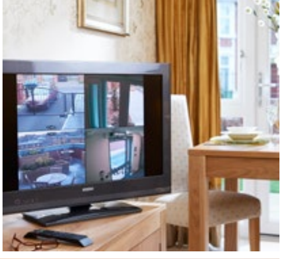
Designed to make your life easier