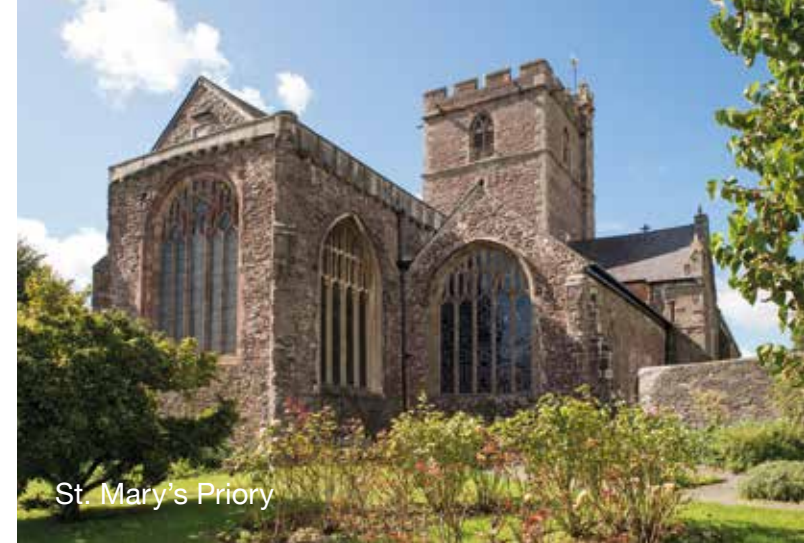
St. Mary's Priory