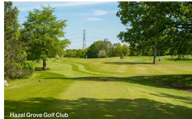
Hazel Grove Golf Club