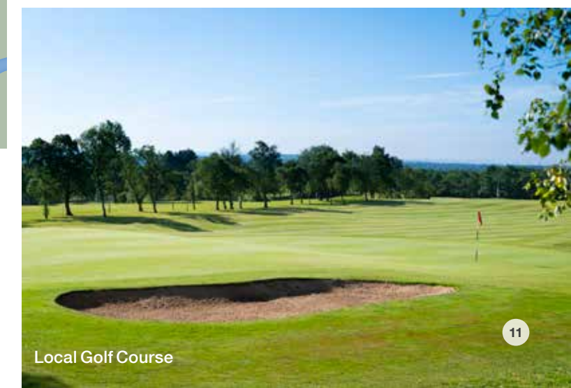
Local Golf Course