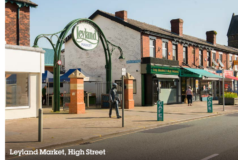
Leyland Market, High Street