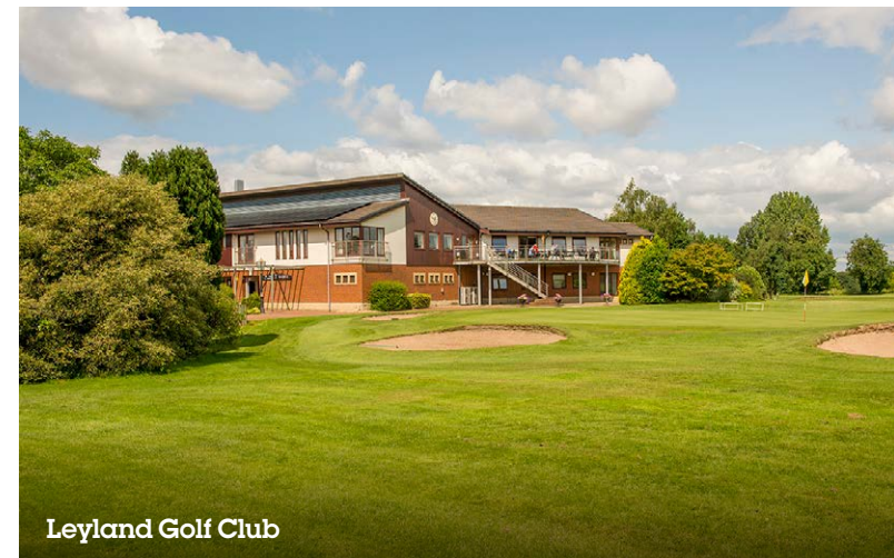
Leyland Golf Club