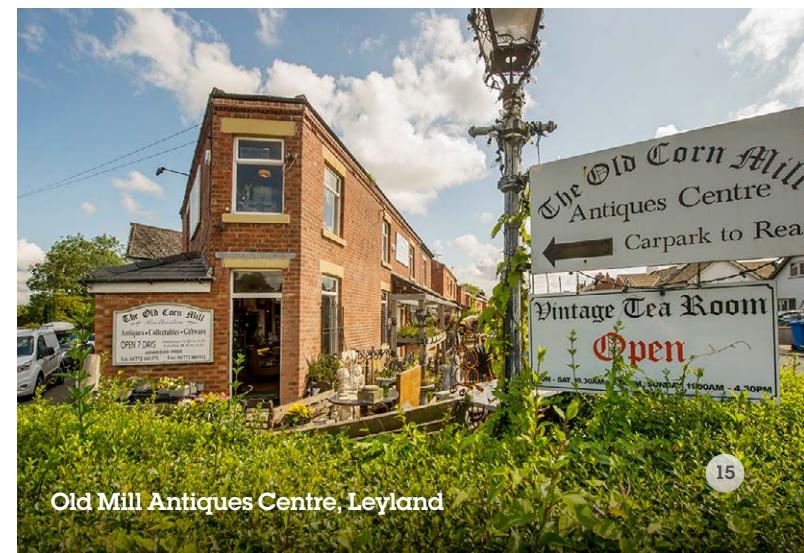
Old Mill Antiques Centre, Leyland

Not all attractions and businesses listed, map is indicative.