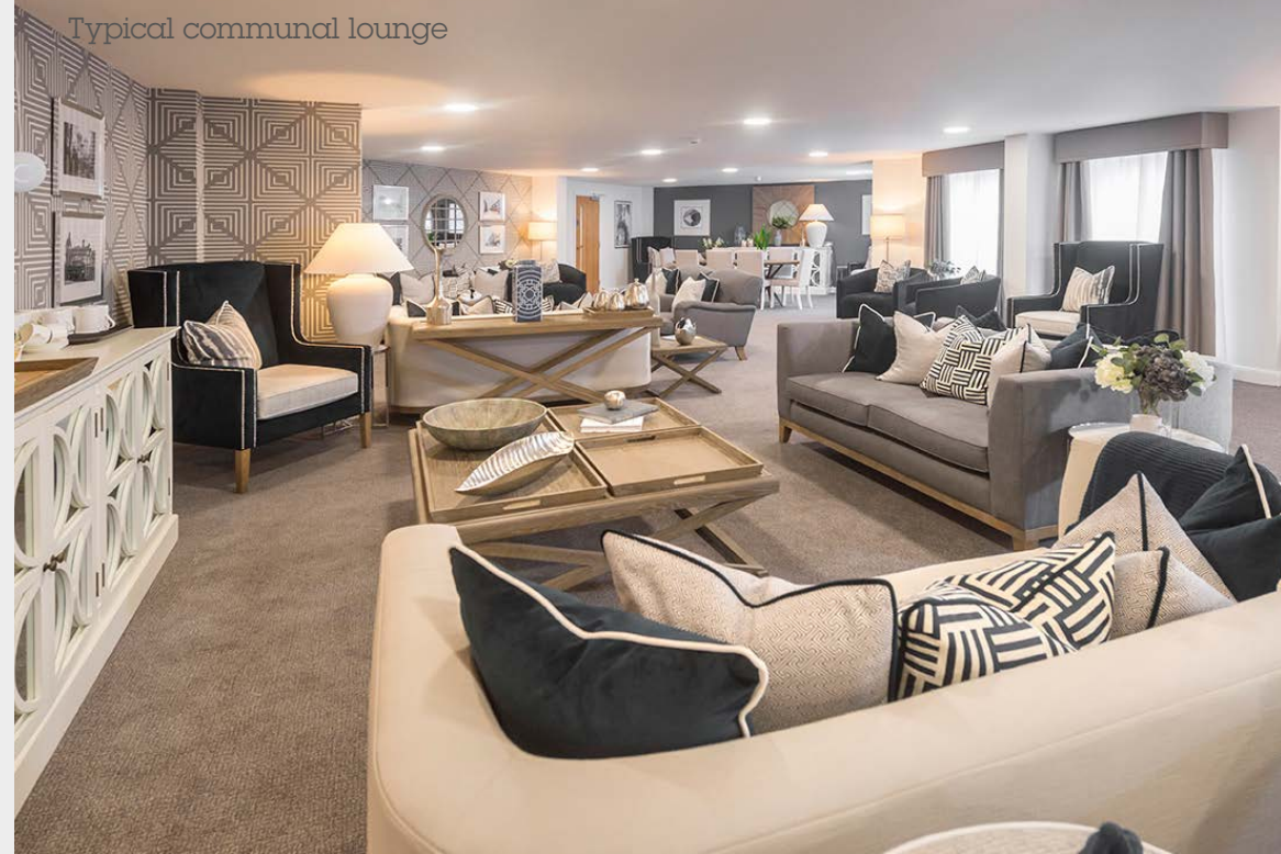
Typical communal lounge