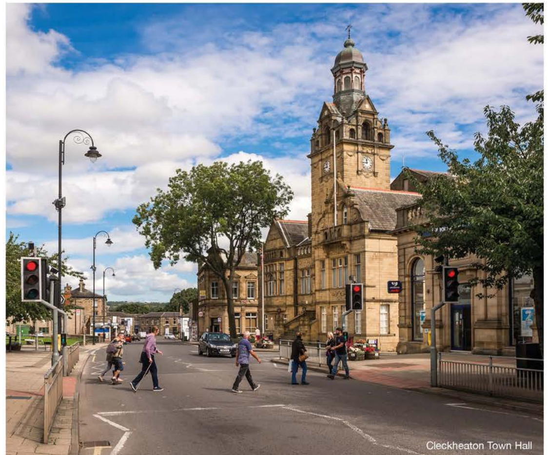
Cleckheaton Town Hall

At Brooke Dene Court you can enjoy your beautiful apartment free from the worry of exterior maintenance. Feel safe and secure with a camera entry system linked to your TV in your apartment and emergency call points answered 24 hours a day. What's more when you feel like company, the homeowners' lounge is a welcoming space where you can socialise with friends and neighbours.