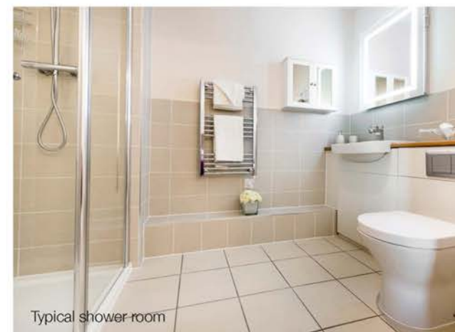
Typical shower room