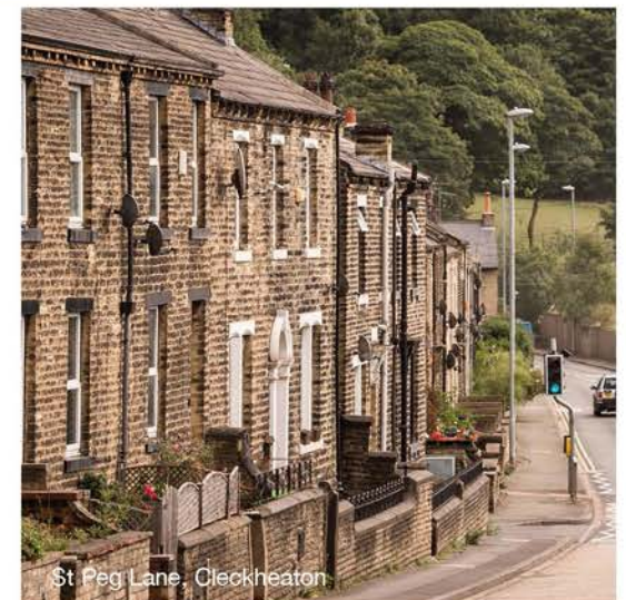
St Peg Lane, Cleckheaton

Convenient location Low maintenance apartments Homeowners' lounge Guest suite* 24 hour emergency call system Camera door entry system Lift to all floors Landscaped gardens Private parking*