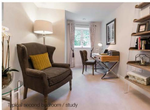
Typical second bedroom / study

Every apartment comes with a two year warranty for most aspects of the construction, backed up by the reassurance of an NHBC guarantee which covers major structural defects for a further eight years.